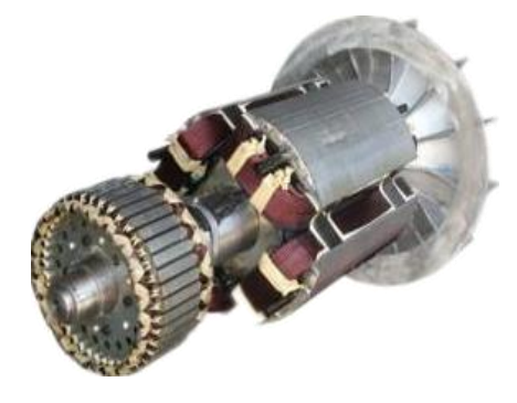
Big Shaft & Copper Wire