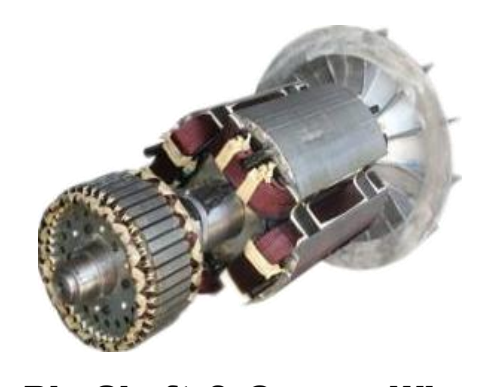
Big Shaft & Copper Wire