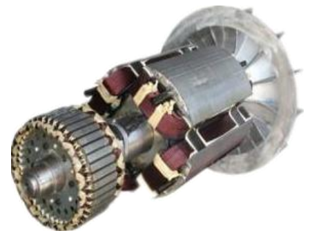
Big Shaft & Copper Wire

www.emeanpower.com Email: sale5@fjepos.com Phone: +86 19890349907