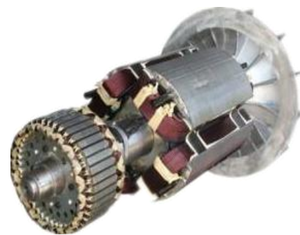
Big Shaft & Copper Wire

www.emeanpower.com Email: sale5@fjepos.com Phone: +86 19890349907