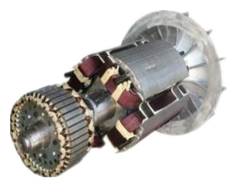
Big Shaft & Copper Wire

www.emeanpower.com Email: sale5@fjepos.com Phone: +86 19890349907