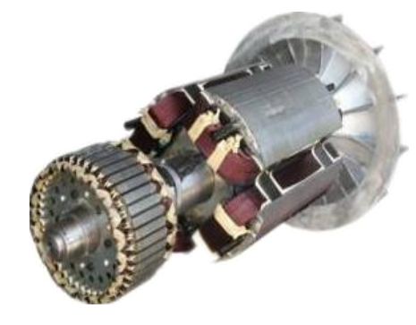
Big Shaft & Copper Wire