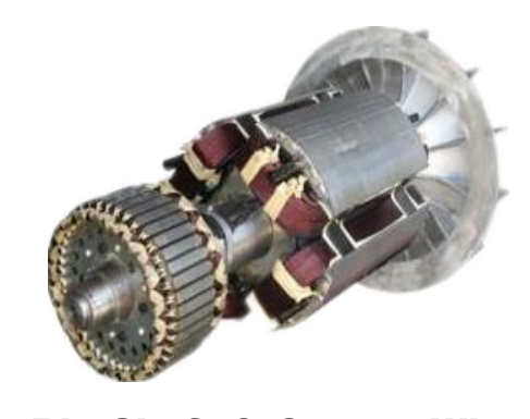
Big Shaft & Copper Wire